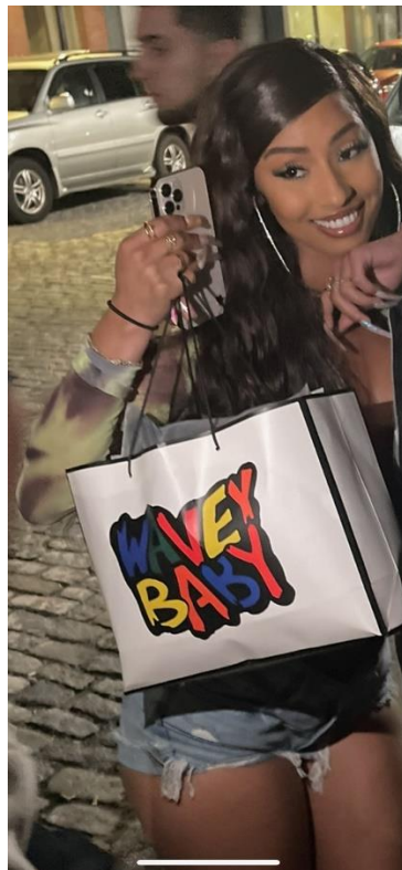
World-renowned hip-hop music recording artist and television star Rubi Rose (over 140 Million music views)