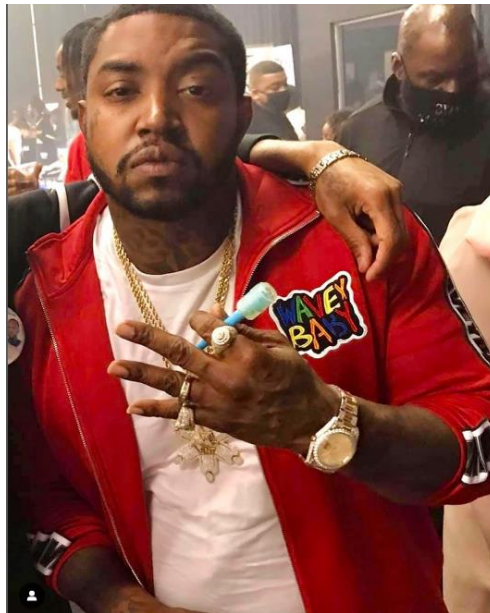
World-renowned hip-hop music recording artist and television star Scrappy (over 28 Million music views)