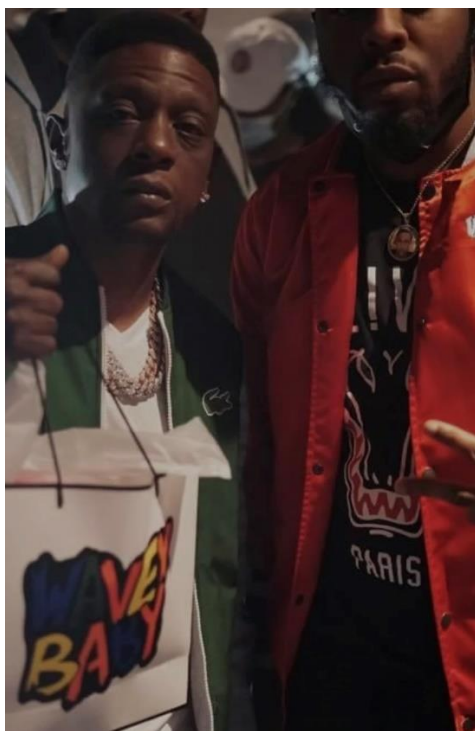
World-renowned hip-hop music recording artist and social media star Boosie (over 1 Billion music views)