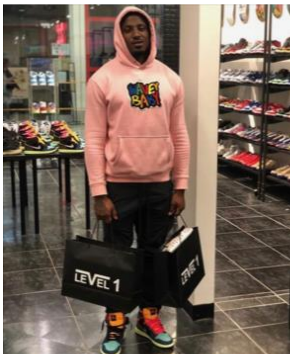
National Football League (“NFL”) All-Pro Award-Winning Defensive Player J.C. Jackson