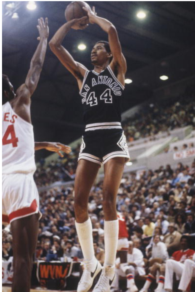
(Mr. Gervin in his iconic Nike Blazers –)

partnership with Mr. Gervin, who became the first to debut the Blazer model in an NBA game.