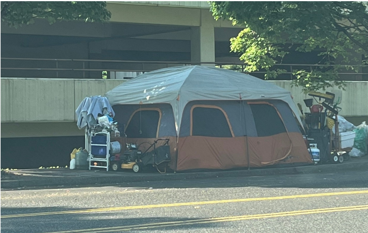
The tent encampment in this photograph completely blocks the sidewalk on the south side of NE Halsey Street near 9 th Avenue in the Lloyd District.