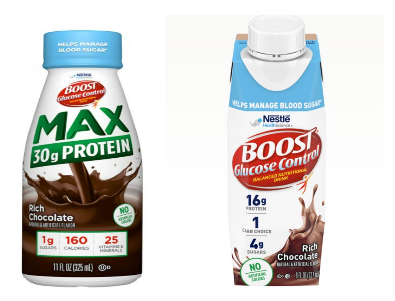
16. All the Products are labeled "Glucose Control" and are otherwise substantially similar. The Products come in a variety of sizes and are commonly sold in multi-pack paper containers. The multi-pack packaging contains the same representations, which are repeated on the individual bottles contained therein.

17. Defendant further categorizes the Products as "diabetes-friendly" on the product page of its website: